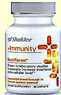
NutriFeron: Daily Immune System Support