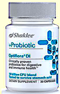
Optiflora DI: Powerful Probiotic