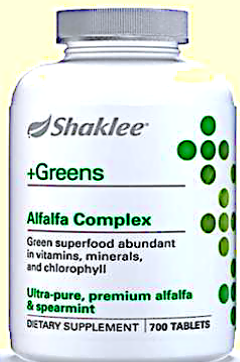
Alfalfa Complex: Green Superfood

Deeply rooted nutrition ... a smorgasbord of vitamins/minerals that act as a natural anti-inflammatory and blood purifier.