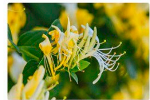
Japanese Honeysuckle Flower