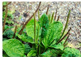
Asian Plantain Seed